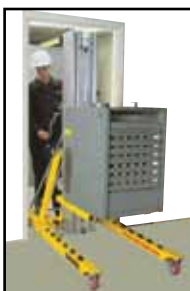
Fits through doorways!

Reversible Forks Using plunger pins, forks remove and reverse easily for added height or to get flush with a ceiling. No loose pieces!